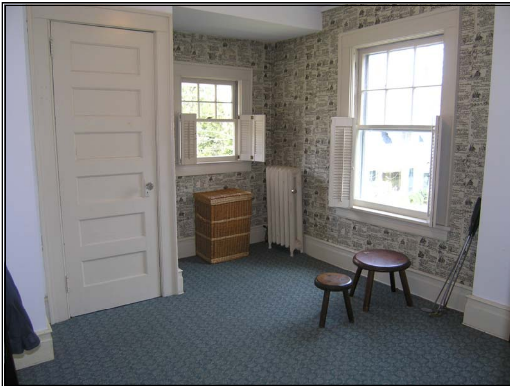
AFTER Neat and empty with more light