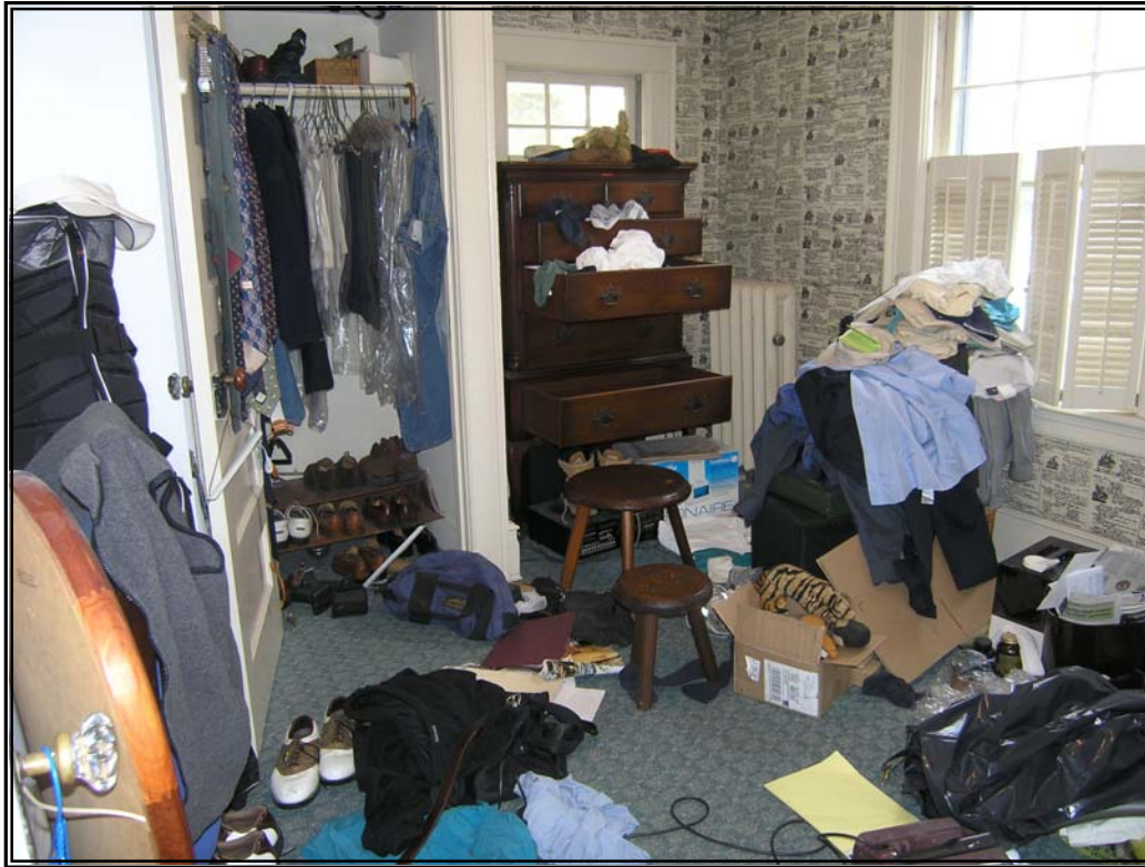
BEFORE A messy dressing room